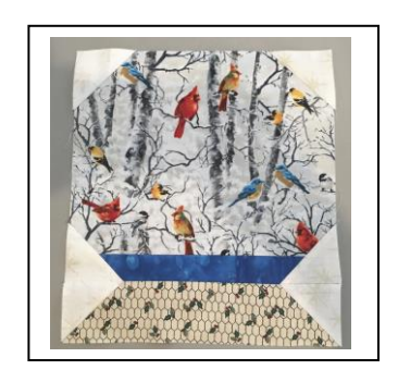
Step 5: Per the photo, stitch two Fabric A 1 \frac{1}{2} " x 11 \frac{1}{2} " rectangles to each side of the Globe/Base piece. Stitch one Fabric A 1 \frac{1}{2} " x 12 \frac{1}{2} " piece to the top.