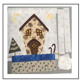
Block #9, Snow Globe, will measure 12 \frac{1}{2} " by 12 \frac{1}{2} " unfinished and 12" by 12" in the quilt.